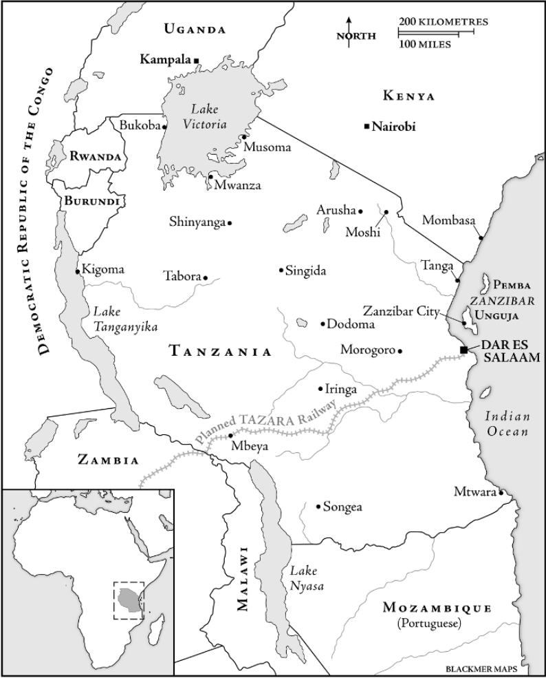
Map 1.1 Tanzania and its neighbours, circa 1968. Map by Kate Blackmer.